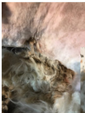
Dirt & debris is caught in the coat and pulls on the skin.

Certain breeds need more grooming than others and some can be particularly prone to matting. Without regular grooming, mats can trap dirt and debris, can pull on the skin and cause pain and discomfort to your dog. It can also provide a breeding ground for bacteria and can cause skin infections. Often there is no alternative but to shave the coat. In extreme cases, it may be necessary for the coat to be removed under sedation by a veterinary surgeon.